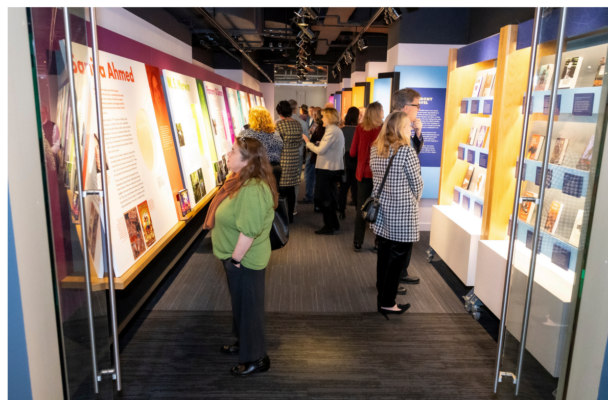
American Prophets opening night reception, November 19, 2025